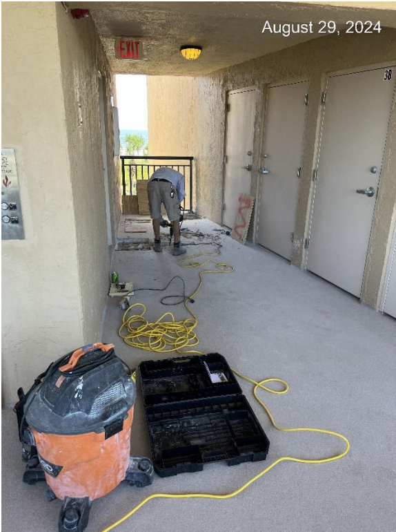
Figure 4. Excavations at the Walkways Continue.