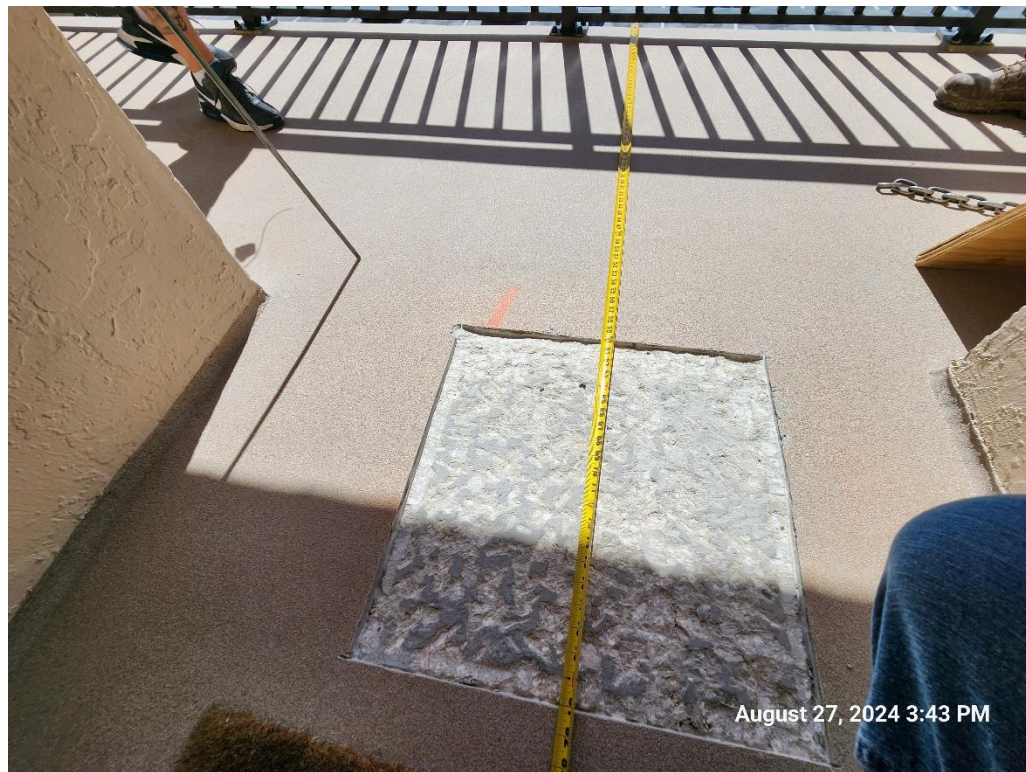
Figure 1. Engineer Measuring Topping for the Record of Repair.