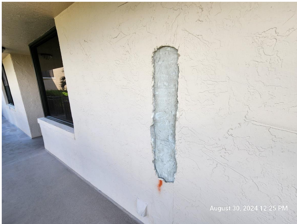
Figure 6. Stucco Repair.