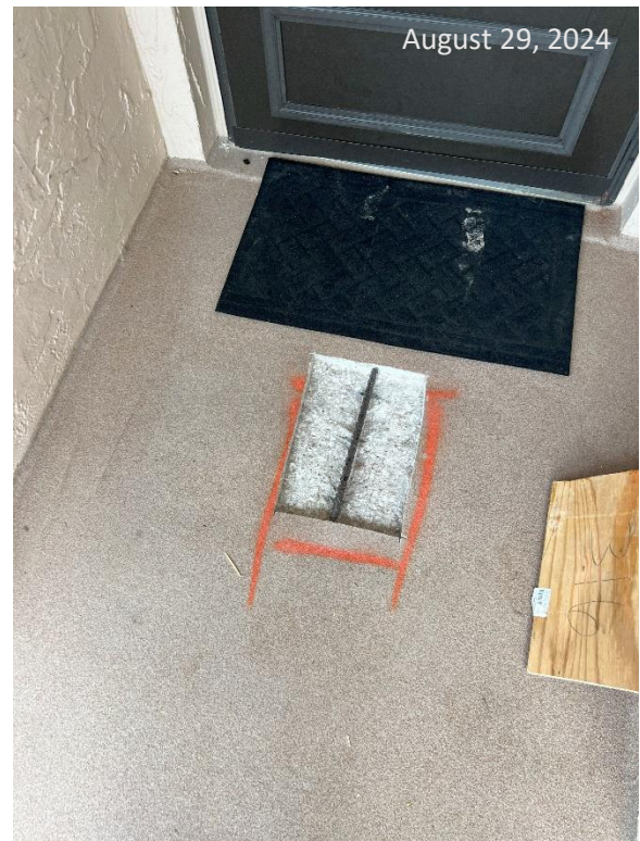
Figure 5. Surface Spall Repair Approved to Cast.