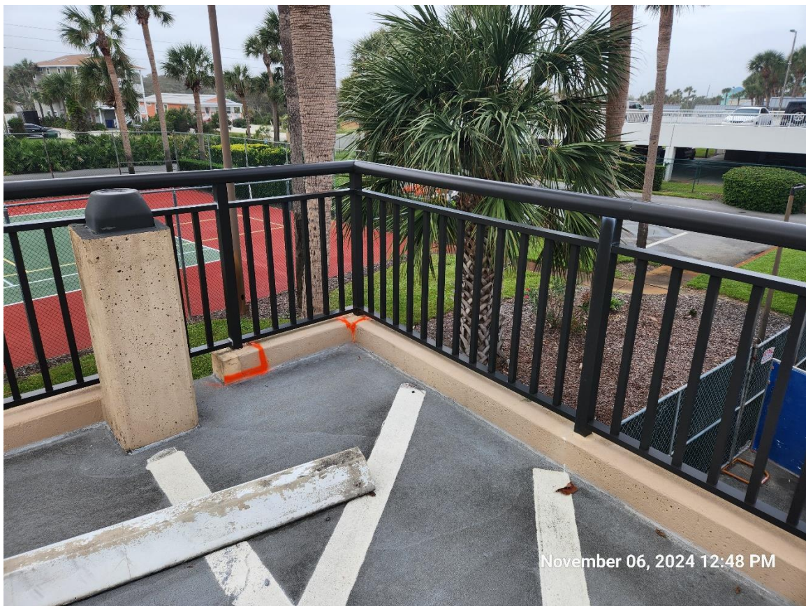
Figure 6. Parking Deck Areas Marked by Keystone.