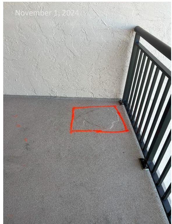
Figure 3. Square Patch Area Painted by Keystone. Unit 316.