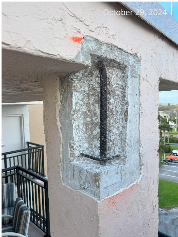
Figure 2. Column Repair Area. Unit 401.