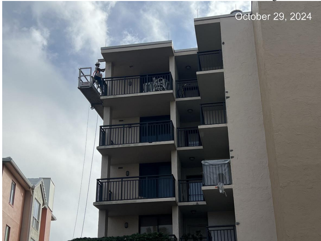
Figure 1. Photo of 01-West Stack with RL James Employees Working.