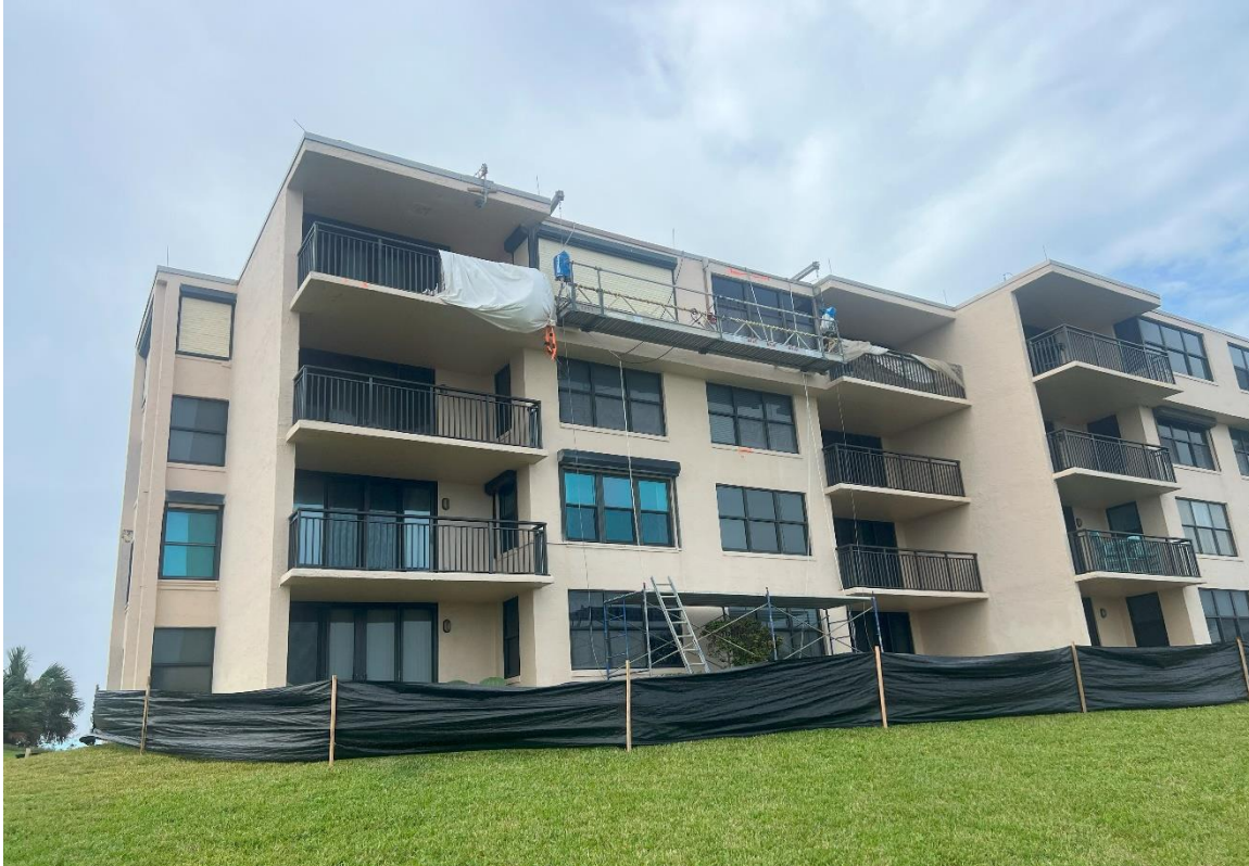
Figure 8. East Elevation View of Swing-Stages at 16 and 17-Stack Balconies.