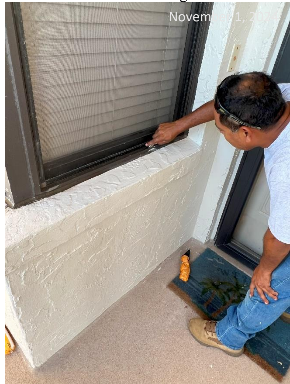
Figure 5. RL James Employee Removing Failed Sealants.