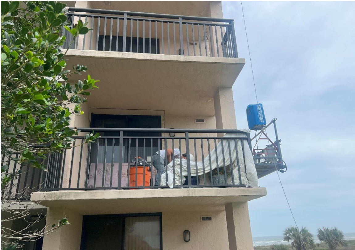
Figure 7. RL James Employee Working on Unit 217W.